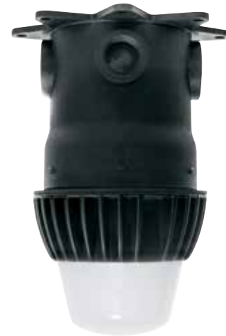
ProSeries LED Utility Luminaire (P/N: 15913)