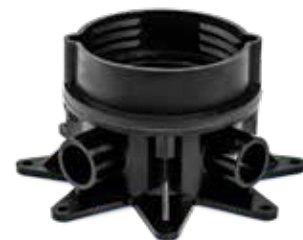
SPIDERBOX™ with Glue-in Hubs and Adapter (3/4” Hubs) (P/N: 15248-ADAPTER)