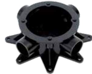
SPIDERBOX™ with Glue-in Hubs (3/4” Hubs) (P/N: 15248)