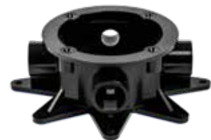
SPIDERBOX™ with Glue-in Hubs (1/2” Hubs) (P/N: 15245)